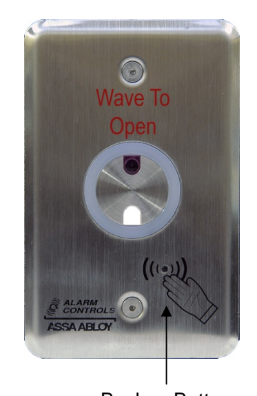
Backup Button (Use if motion detection fails to operate switch)