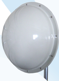
Dish antenna shown with optional radome