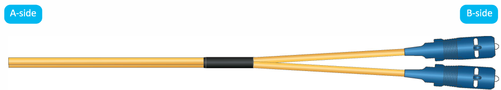
Figure 8 Fiber Cable