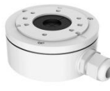
DS-1280ZI-XS Junction box