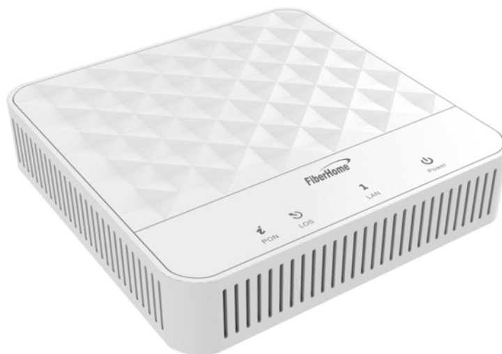
Figure 2-5 Overall Look of the AN5506-01-A

The overall look of the AN5506-01-A is shown in Figure 2-5.