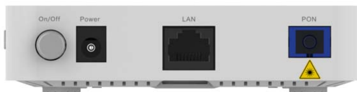
Figure 2-6 Rear Panel of the AN5506-01-A